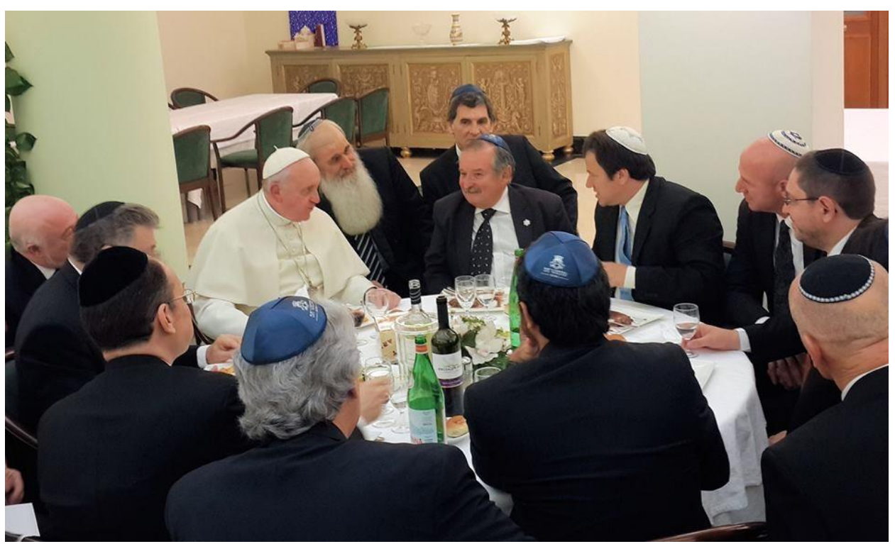
Francis delights in the unwavering friendship of the most tenacious enemies of Christ.