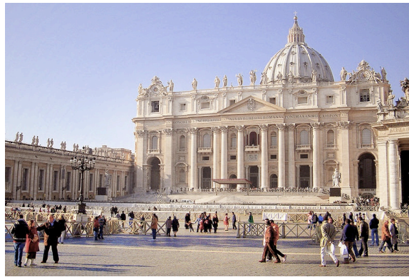
The Modernists attempt to use the magnificent and strong institution of the Catholic Church — of which St. Peter's Basilica is a brilliant symbol — in order to spread their apostasy. It is an ingenious plan devised by the devil himself.

mental gymnastics in order to see continuity of doctrine, discipline, and worship. They descend into a religion of a naked emperor, that is, they make a groundless and truly insane act of faith, with absolutely no motives of credibility, believing Modernism to be actually Roman Catholicism. In their minds they cover the