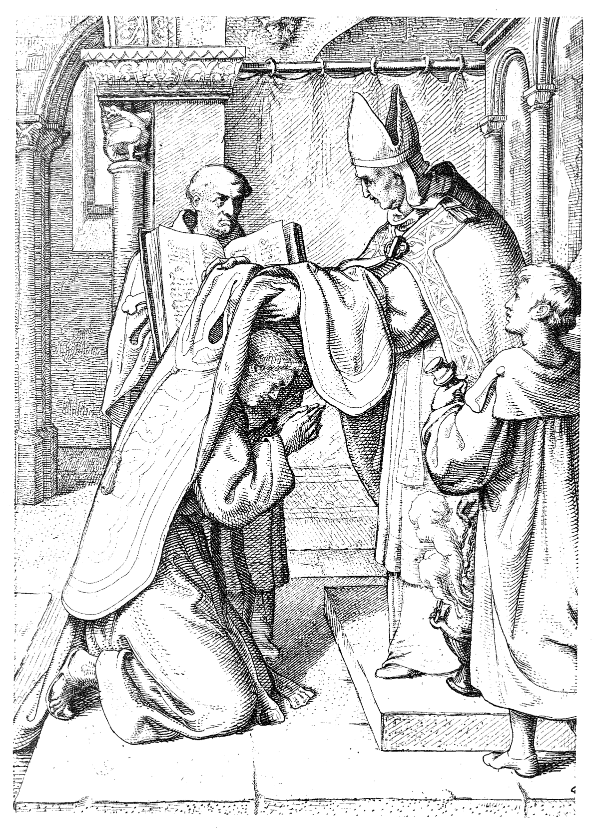
Take thou the garment of the priesthood, which signifies charity; for God is able to advance thy charity to perfection.

- Ordination Rite, The Roman Pontifical, 1644 -