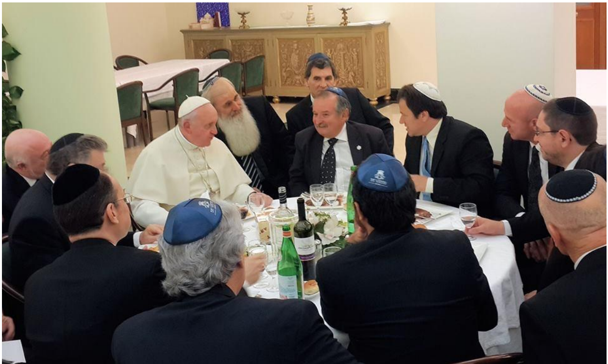
Francis delights in the unwavering friendship of the most tenacious enemies of Christ.