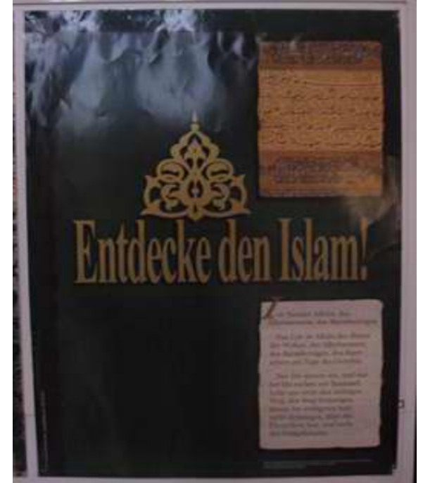
" Entdecke den Islam! -- Discover Islam!" [very appropriate for a Catholic Church to host]

But the worst was the statue of Buddha in a church where the "Blessed Sacrament" remained reserved throughout the day: